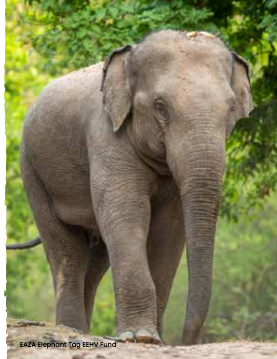
EAZA Elephant Tag EHV Fund

Colchester Zoo receives a large amount of requests for complimentary tickets to assist with fundraising efforts. These requests have grown to such an extent that it has resulted in us having to put a policy in place. To manage the process of donating tickets, a criteria MUST be met along with an application form. To find out more and submit an application form, please visit www.colchesterzoo.org