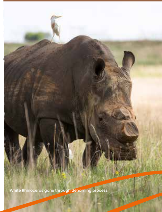
White Rhinoceros gone through dehorning process