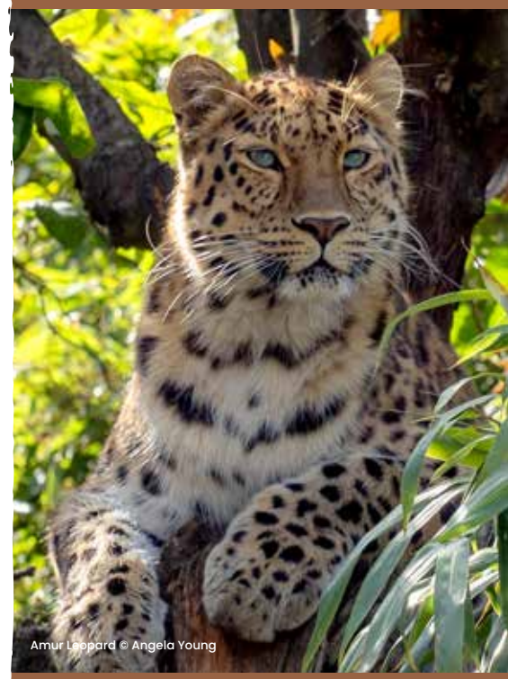
Amur Leopard