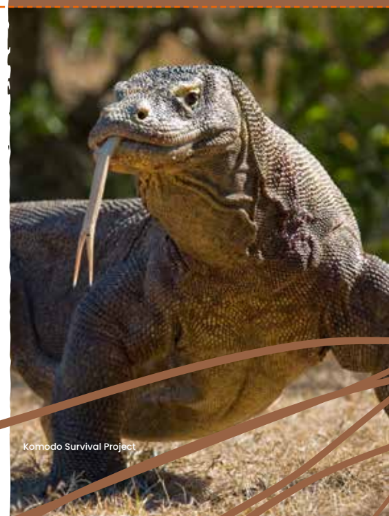
Komodo Survival Project