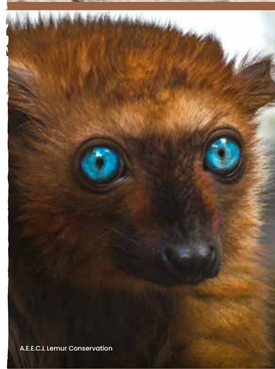
A.E.E.C.L Lemur Conservation