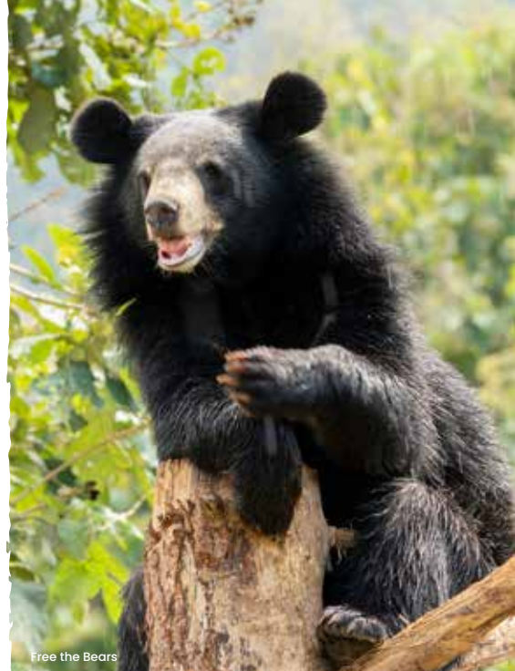
Free the Bears