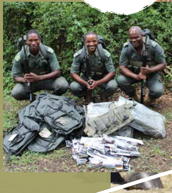
L-R: Interns collecting data. Field Rangers with donations.