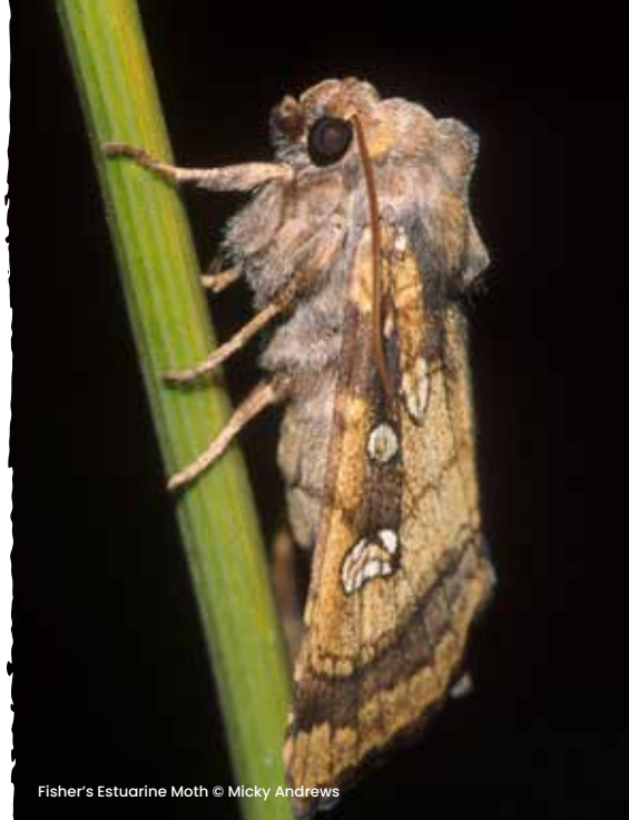
Fisher's Estuarine Moth

For more information, read our 2022 Annual Report at www.actionforthewild.org